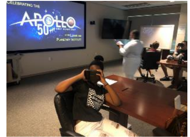
A young explorer tours the Moon in VR.