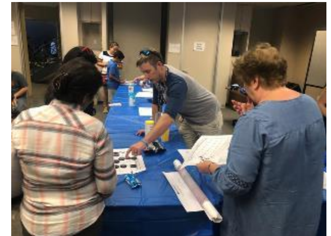
Visitors model Moon phases using Oreo cookies.