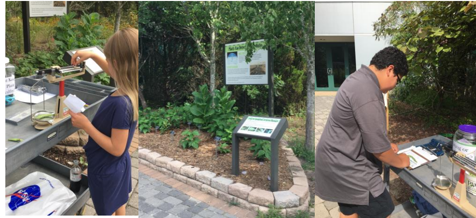
Students engaged in hands-on science learning activities in the TEMPO ozone garden.